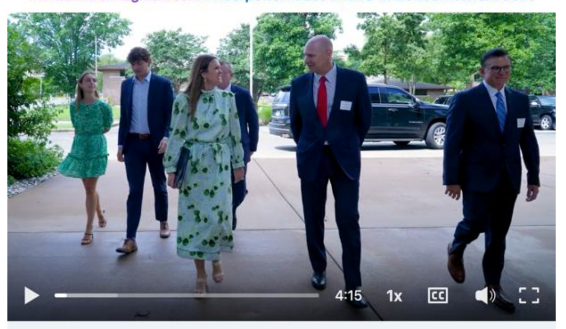
Uniti - Windstream Merger Announcement

www.unitireimagined.com #fiberpowerhouse #nationwidefibernetwork #cus